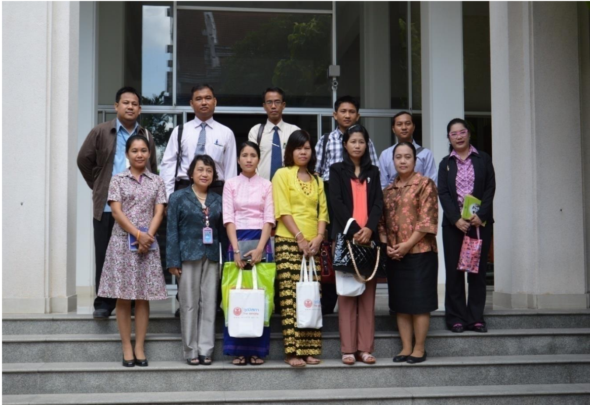
13. Site Visit Library and Archives of the Bank of Thailand