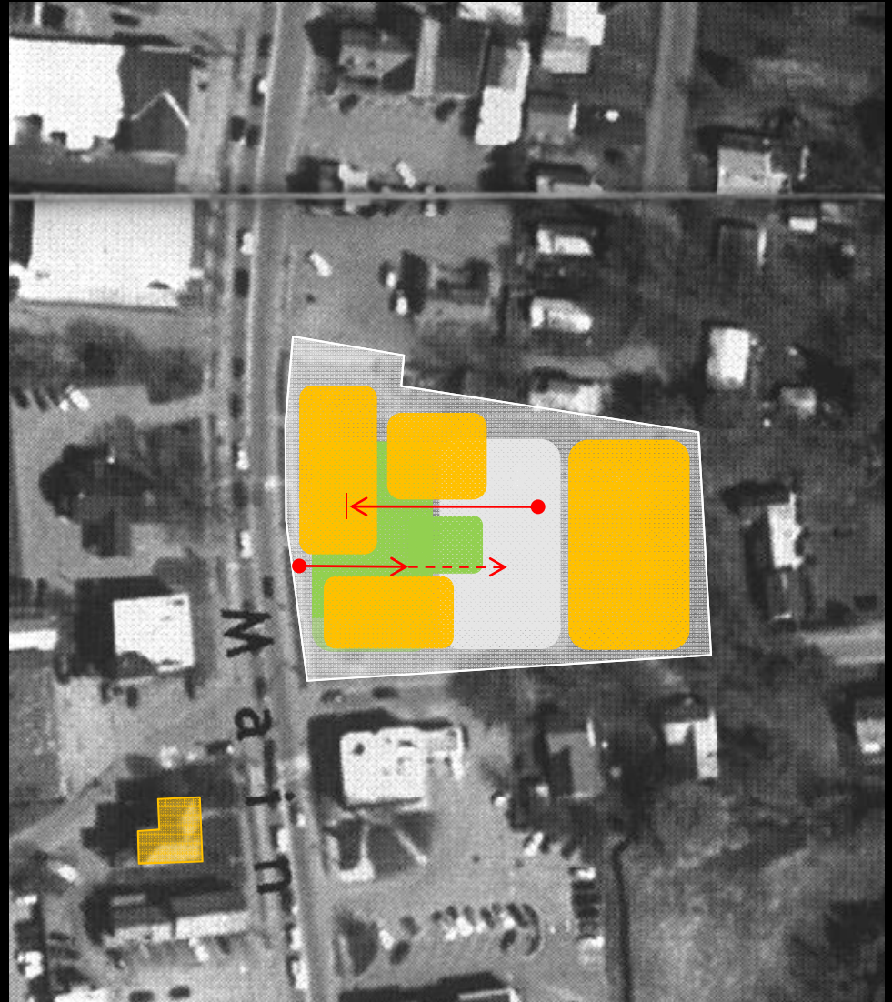
library acts as a magnet for the community & supports the revitalization of local businesses