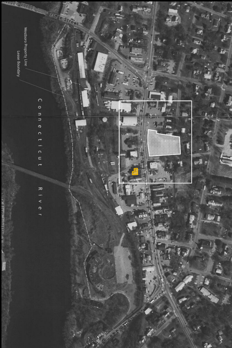
abandoned used car lot was a "missing tooth" in the development of the street