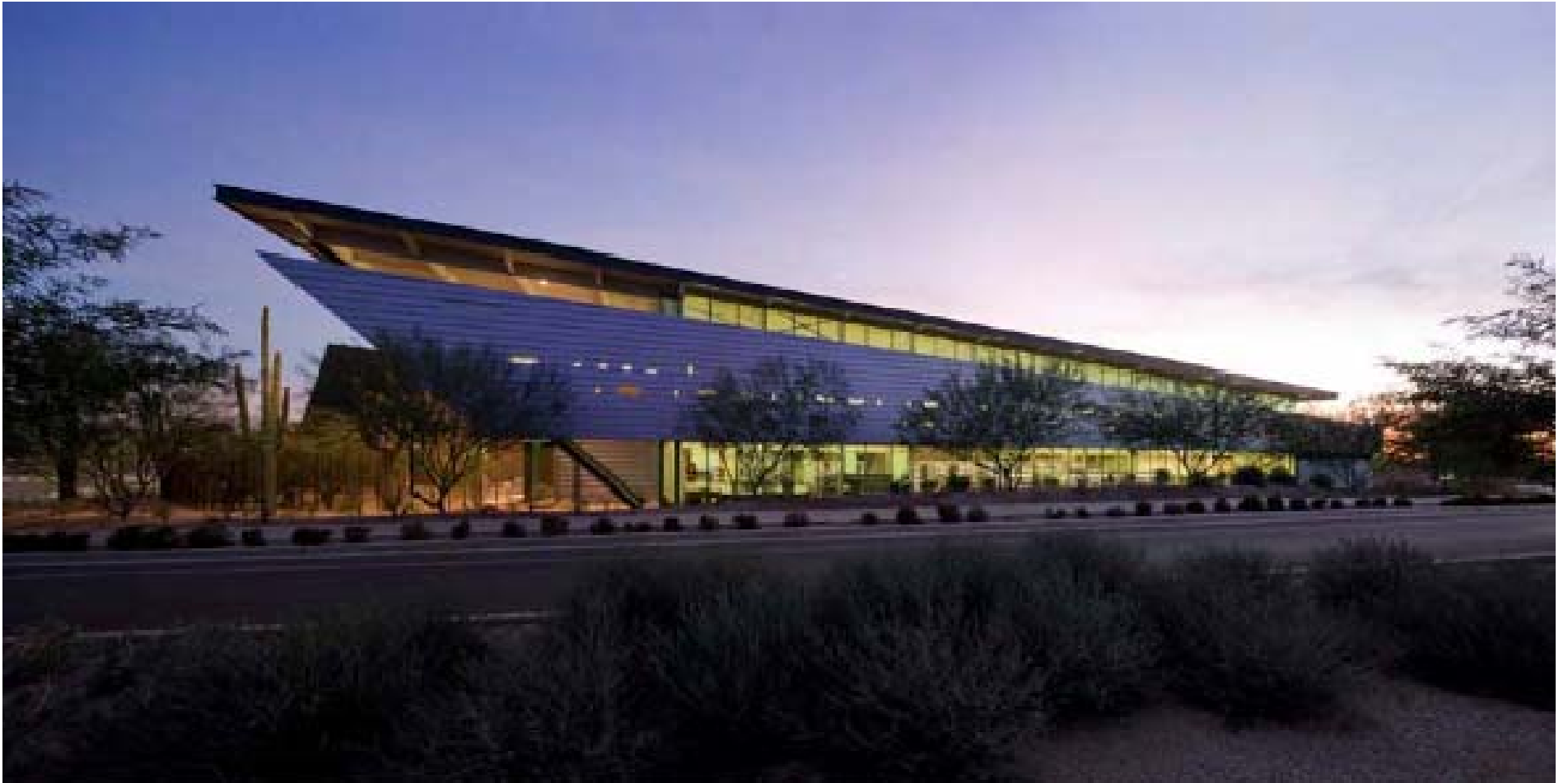
Appaloosa Branch Library, Scottsdale, AZ