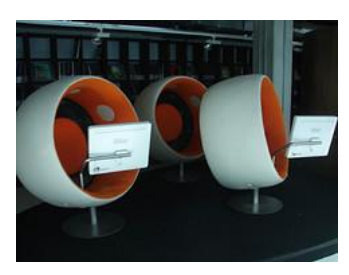
DOK: a must-visit model library www.dok.info/

German Library of the Year 2008 www.bsb-muenchen.de/