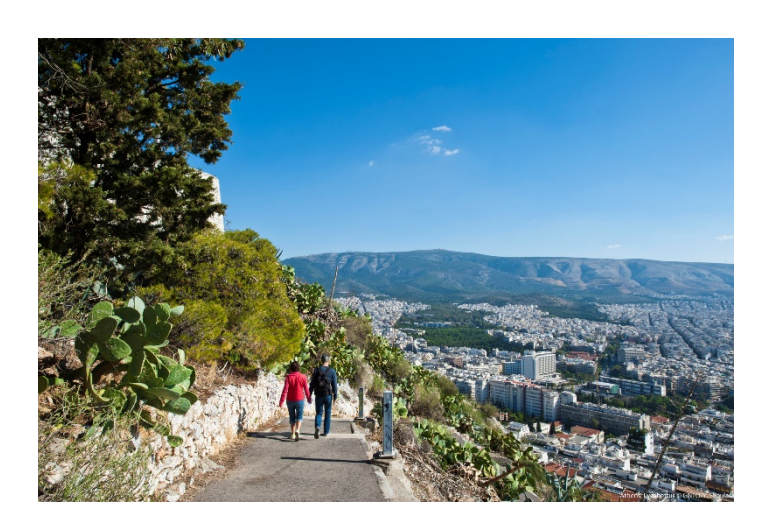
Athens Lycabettus Hill. Photo Y. Skoulas <a href="http://www.visitgreece.gr/en/downloads/image-bank">http://www.visitgreece.gr/en/downloads/image-bank</a>