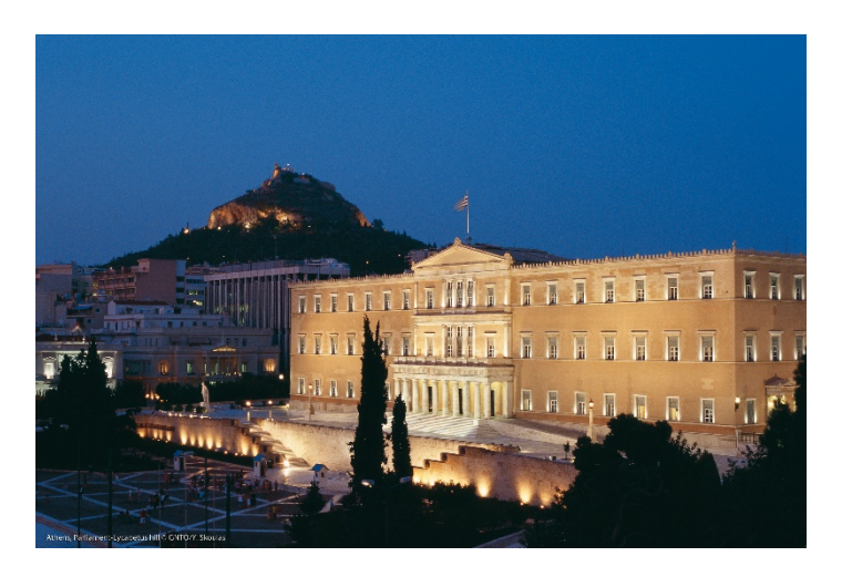
Athens Parliament. Photo Y. Skoulas <a href="http://www.visitgreece.gr/en/downloads/image">http://www.visitgreece.gr/en/downloads/image</a> bank

For information about visiting Greece see: <u>Visit Greece</u> http://www.visitgreece.gr