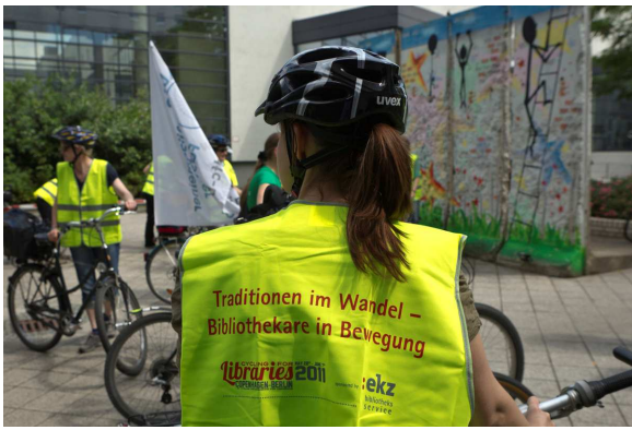
"Cycling for libraries"

A demonstration of about 100 cyclists ("cycling for libraries") which had started in Copenhagen and which went all the way to Berlin only to draw attention to the importance of libraries to society.