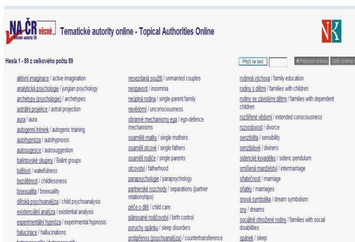
Figure 3: Example of topical terms in both Czech and English languages (proposal)