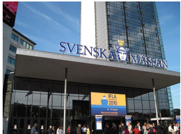
Swedish Exhibition and Congress Centre, Gothenburg

X Congreso de ISKO-España. Secretaría Técnica Universidade da Coruña Facultad de Humanidades C/ Doctor Vázquez Cabrera, s/n E-15403 FERROL