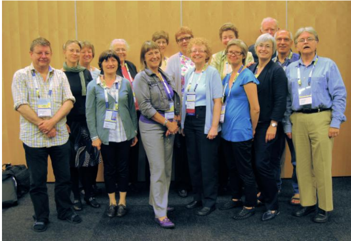
Standing Committee members in Gothenburg