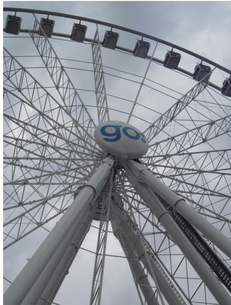
The Wheel of Gothenburg