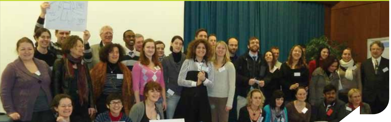
Participants of NPSIG workshop "This is how we do it," BOBCATSSS 2011 ( http://www.bobcatsss2011.com/ )