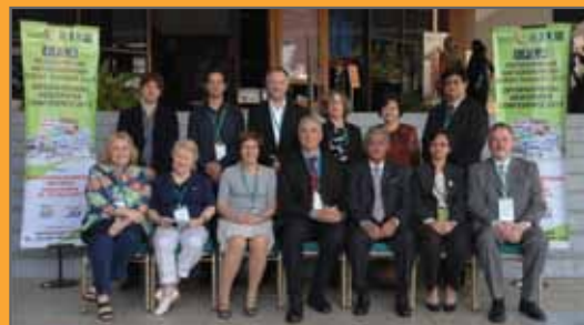
The conference organisers accompanied by speakers and standing committee members at the entrance of the National Library of Malaysia, Kuala Lumpur