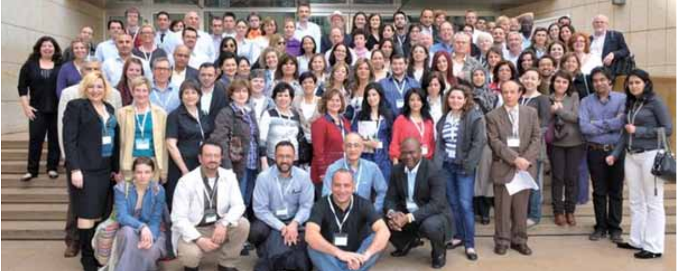
Participants of the 8th Annual AMICAL Conference

Instructor/Librarian, Lebanese American University Member, IFLA Regional Standing Committee for Asia and Oceania