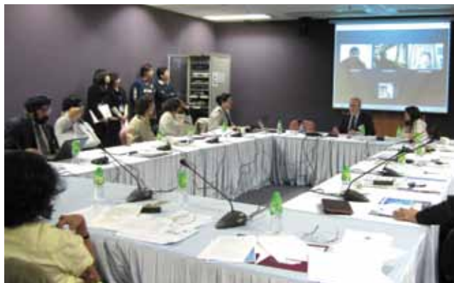
Use of Skype with RSCAO members

Regional Office updated that the membership for Asia and Oceania stands at 323 members and 57 member countries as at November 30, 2010. For the period June 1–30 November 30, there were twenty-nine new members