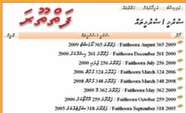
Figure 2: “Title” view of the Digital Library which displays all the titles in the library (displayed in the English language interface)

At present, the digital library can be browsed by title and date as seen in Figure 2. It can be searched based on the title of the articles as seen in Figure 3. While full text is available, it is not searchable at present due to issues with optical character recognition of Dhivehi script on scanned documents. This enhancement is marked as the next phase of the MNU Library’s DL project for Faithoora. The creation of this collection has facilitated in the creation of other much needed Digital Library collections of local material.