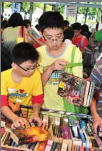
Children selecting books at the Book Exchange

Book lovers in Singapore did their part for the environment while indulging in their love for reading at the National Library Board's Book Exchange event. Held for the third successive year, this event allows book lovers to exchange their used books with each other. Apart from being an economical way to update one's book collection, the Book Exchange helps to save the environment by minimising wastage.