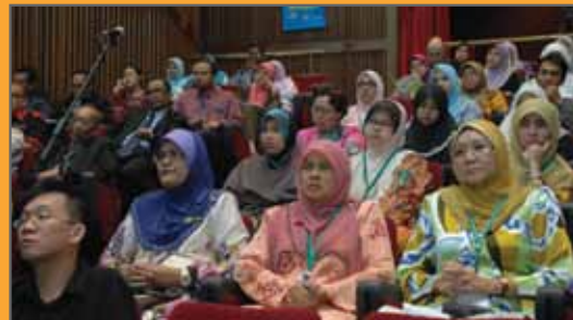
Prick-eared audience, mainly from Asian countries