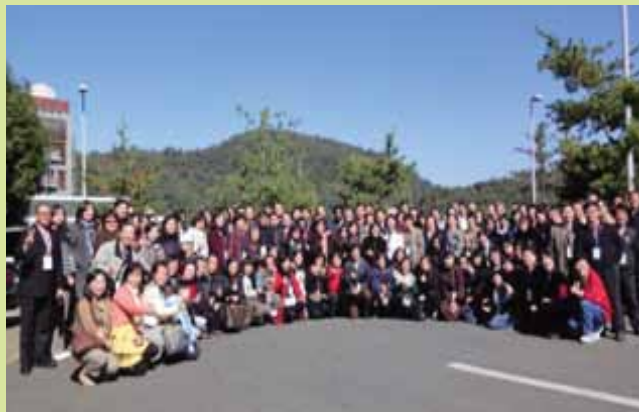
Participants of the the Second World Chinese Teacher Librarians' Forum

In addition to the three keynote speeches, the Forum was packed with sixteen presentations and papers covering a wide variety of topics including the promotion of reading and writing activities in school libraries, the development of school libraries in different places, the enhancement of reader services in school libraries, the application of Web 2.0 in school libraries, and other practical issues related to the provision of school library services. The Forum is an excellent opportunity for Chinese teacher librarians to build up personal networks and to share experience with colleagues in the region.