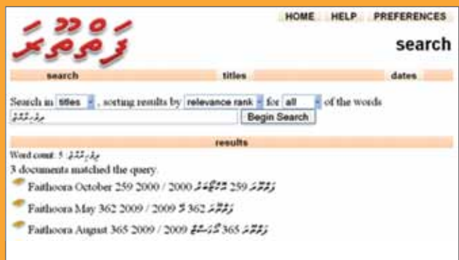
Figure 3: Search result for the term “dhivehiraajje” (Maldives) – (displayed in the Dhivehi (local) language interface)