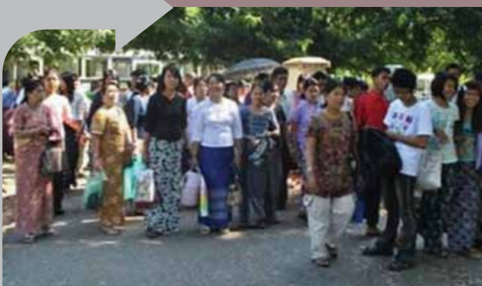
Library visit to the university libraries by participants of the Basic Training Course