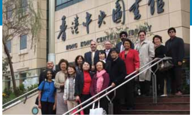
RSCAO members were hosted to a tour of the HKCL

Ellen also stressed the five key initiatives IFLA will develop for 2011–2012 to better enable libraries and librarians to drive access to knowledge: