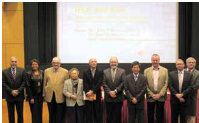
Speakers at the half-day seminar with our Hong Kong colleagues