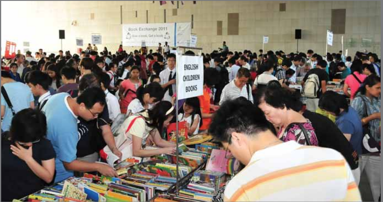
Book Exchange participants at the Plaza, National Library Building

Librarian Deputy Project Manager for Book Exchange 2011 National Library Board Singapore