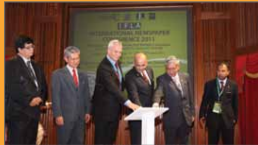
Opening of the Conference by the Deputy Minister of Communication, Information, and Culture of Malaysia, Senator Maglin Dennis D’Cruz

April 25–27 the National Library of Malaysia hosted the 2011 Newspapers Section Conference at the National Library in Kuala Lumpur. In these times of tight library budgets it was surprisingly well-attended with approximately 150 delegates from all Malaysian states as well as Australia, Singapore, Germany, the Netherlands, Finland, France, USA, and India. The news of the conference was in six national newspapers in English and Malay. It was opened by the Senator Maglin Dennis D’Cruz, who is also Deputy Minister of Communication, Information, and Culture. Keynote addresses were given by the Chief Executive Officer of the largest media company in Malaysia, Johan Jaafar, and the General Manager of the Malaysian National News Agency (Bernama), Hasnul Haasan. The conference was opened with dancers and a song composed especially for the conference, setting a very high standard for future newspaper conferences!