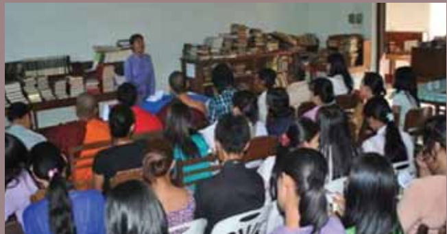
Lecture by the Librarian from the Yangon University Library for the Basic Training Course

Fifteen executives of the Association meet monthly and discuss the progress of each sector to consider the functions to be developed. There are nine sectors responsible for the development of library professionals such as education, information, international relations, finance, and management.