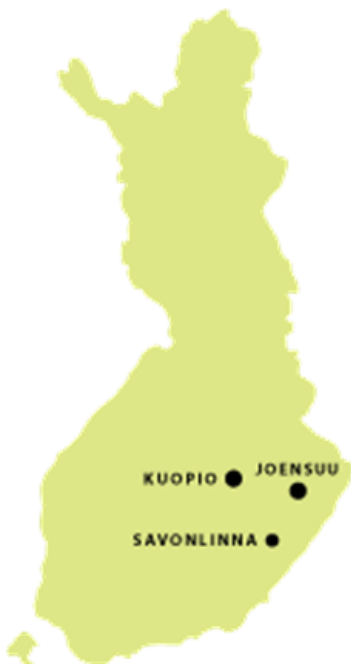
Fig. 1. Three campuses of the UEF

Recently the higher education legislation and structures were reorganized in Finland. A new University Act was passed in the summer of 2009. The new act means that the formerly state-owned Universities have become more autonomous. In addition, the number of Universities in Finland is being reduced by merging some of the existing units into newer, larger versions. One of these new institutions is the University of Eastern Finland (UEF) which was created out of the Universities of Joensuu and Kuopio. The new University has three different campuses, about 130 kilometres apart in the eastern part of Finland (see Fig. 1).