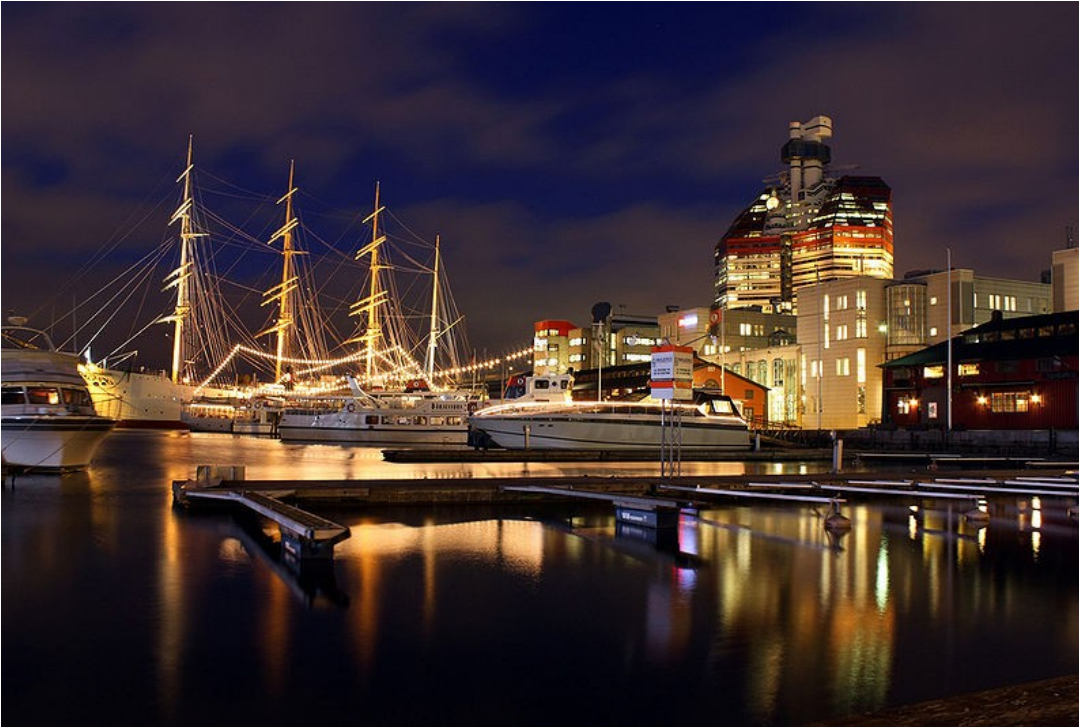
Gothenburg Harbour which inspired the logo for IFLA 2010.

gic plan 2010-2015, particularly from section committees. It announced a seven-year cycle for the location of the annual congress based on its regions. IFLA will be in Asia Oceania in 2013 and in Europe in 2014. The closer definition of officers' roles is also a welcome development.