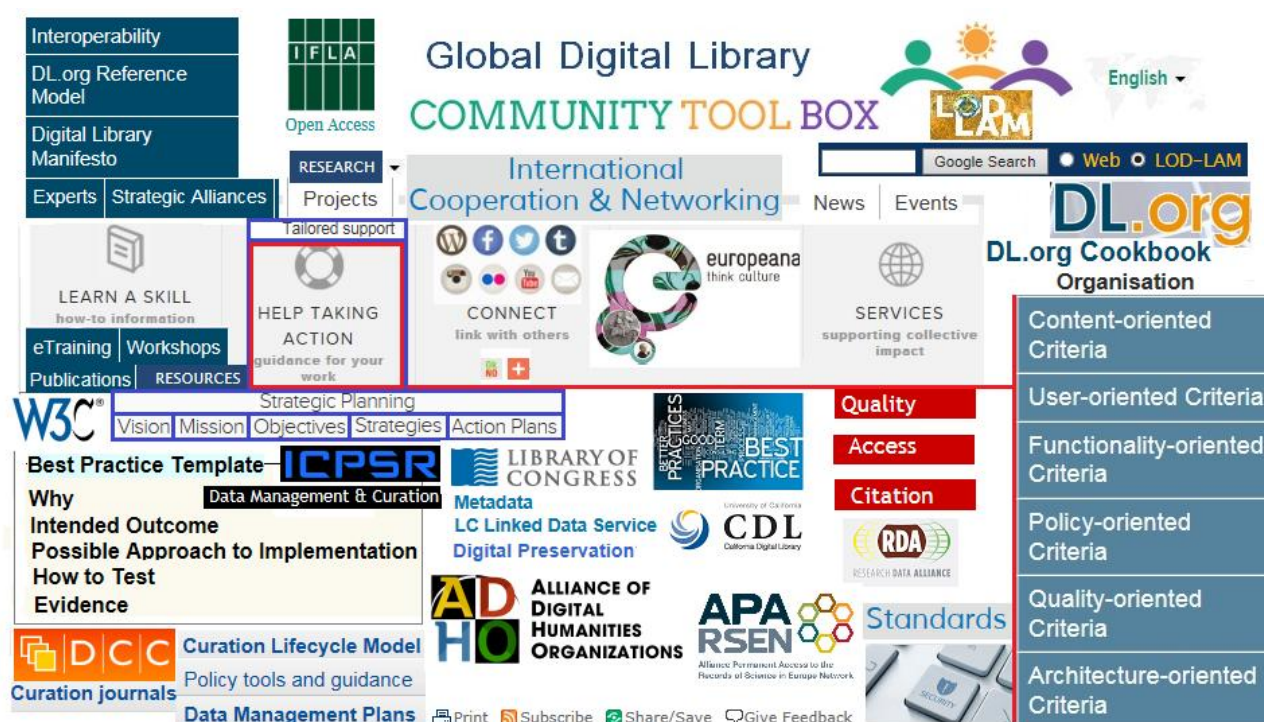
Figure 3. Pillars and clusters for a collaborative Digital Library Knowledge Space.

To design a collaborative Digital Library Knowledge Space (“Global Digital Library Community Tool Box”, as showed in the Figure 3) different approaches can be undertaken.