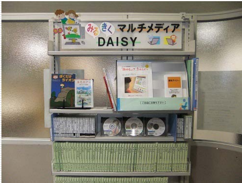
Corner for DAISY Multimedia Books From Choufu City Library