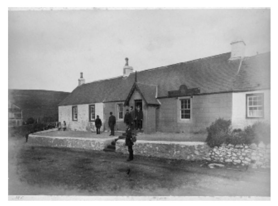
The exterior of Leadhills Library in the 1880s. The building is a miners' cottage in plan adapted to specialized requirements. The whitewashed building next door is the school. Note the schoolgirls but the absence of female library members. Women were not allowed to be members until 1882.

this restriction only applied to a handful of individuals.<sup>24</sup>