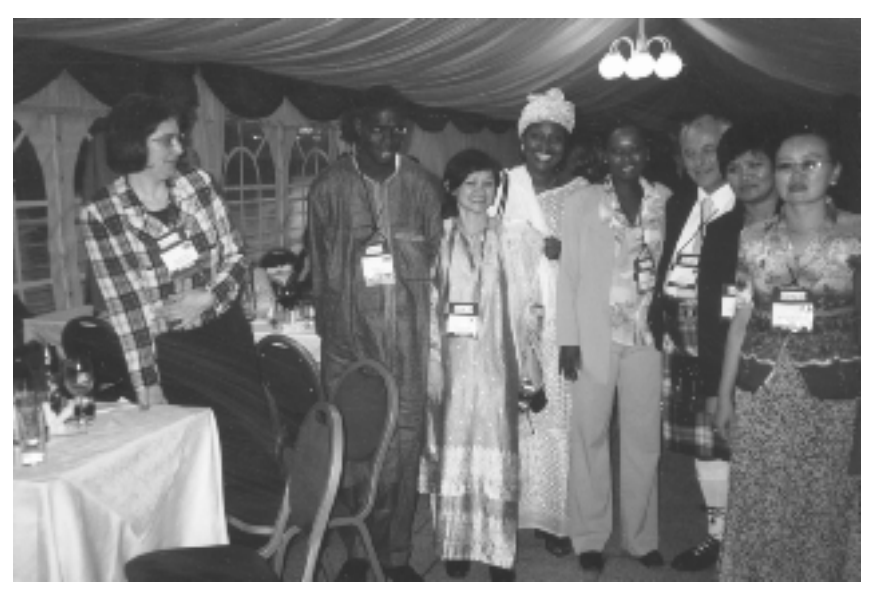
DANIDA Grantees at their reception in Glasgow (Photo courtesy of Birgitta Sandell).

However, as most of the workshops which I would very much like to attend were held concurrently with the library visits, that is on the 22 August, 2002, I had to forgo attending the workshops in order to go for the library visits. I suggest that workshops should not be held concurrently with library visits in future IFLA conferences, as both activities are equally important and interesting.