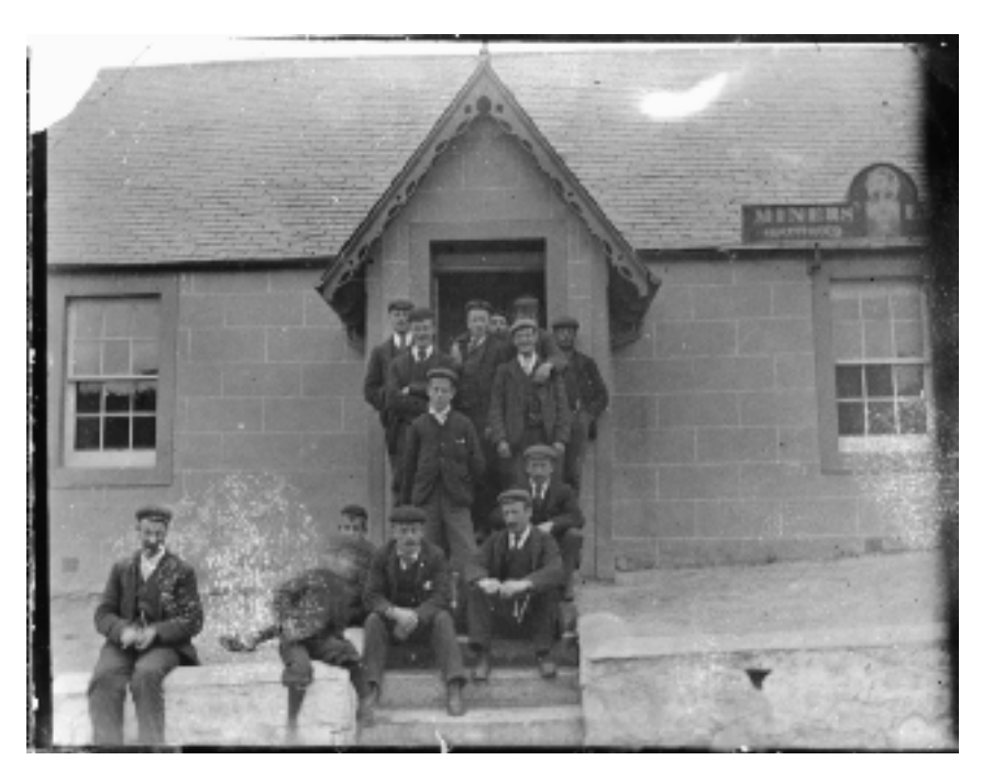
Members of Leadhills Library on the steps of the Library in the 1880s.