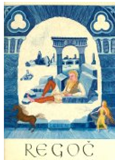
Both Potjeh and Regoč describe the battle between Good and Evil