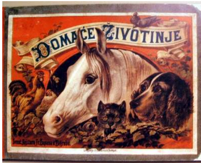
Domaće životinje by Josip Milaković

The first Croatian picture books were organized thematically, in areas that dealt with: animals, children's everyday life, children's games or the alphabet. Text that appears regularly with the picture is a short nursery rhyme . This was the most common literary form in picture books until 1945. These poems are similar to the standard production of poetry for children of that time. Mainly two models were presented: one illuminating, moralizing, outspoken, pathetic, patriotic, and other anecdotal, sweet and sentimental.