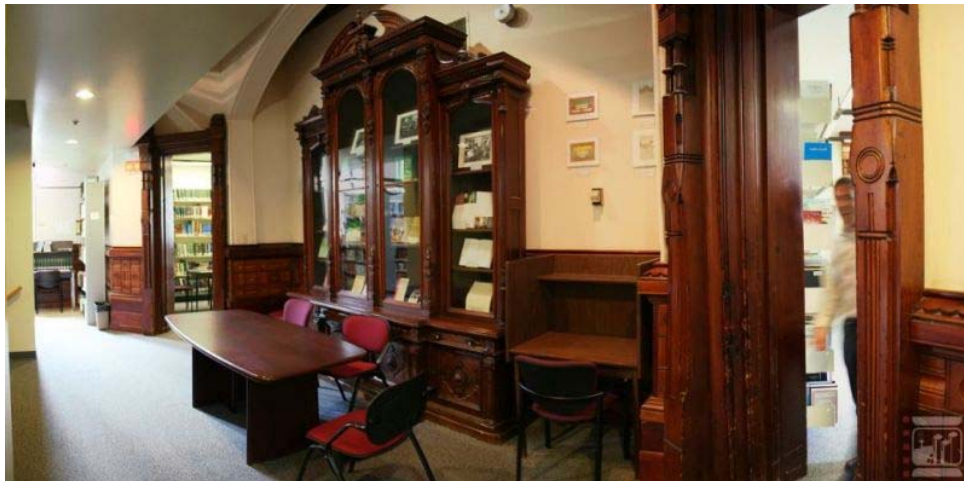
Islamic Studies Library, exhibition area

The Islamic Studies Library is located in Morrice Hall, a Gothic style building in the centre of the campus. The exhibition case itself stands at the heart of the first floor. It is centrally located between study spaces and the stairs leading to the second floor. The display cabinet is of Victorian architecture and holds a maximum of 16 items, and can accommodate material of varying sizes, from elephant folio to standard or regular sized monographs and leaves. Description cards for each item are usually mounted on both sides of the cabinet so as not to interfere with the displayed items. The Shahnameh collection of leaves and manuscripts held in RBSC was recently displayed in the ISL.