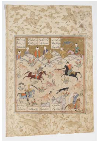
Shahnameh Exhibition: Bahram Gur hunting. McGill University Library

The Shahnameh is one of the foremost literary works to encapsulate the breadth and depth of Iran's historical trajectory. First composed by Ferdowsi to preserve Iran's cultural, linguistic and historical heritage, the Shahnameh, meaning 'the book of kings,' details the history of Iran prior to the Arab invasion in the 7th century. This literary work, a national epic composed in 52,000 couplets tells the story of heroes, villains, monsters and offers sage advice on moral lessons in governance. Legendary are the stories of its famous kings and heroes, especially of Rostam who so fearlessly defended the Persian kingdom in many spectacular battles against the hostile Turanians from the North. The epic also relates the important features of ideal kingship. It narrates the battle between Good and Evil, and is a constant reminder that life is just a transitory memento. 8