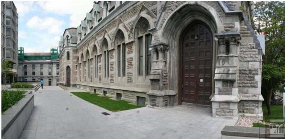
Islamic Studies Library (Morrice Hall), McGill University.

The Islamic Studies Library is located in Morrice Hall, a Gothic style building in the centre of the campus. The exhibition case itself stands at the heart of the first floor. It is centrally located between study spaces and the stairs leading to the second floor. The display cabinet is of Victorian architecture and holds a maximum of 16 items, and can accommodate material of varying sizes, from elephant folio to standard or regular sized monographs and leaves. Description cards for each item are usually mounted on both sides of the cabinet so as not to interfere with the displayed items. The Shahnameh collection of leaves and manuscripts held in RBSC was recently displayed in the ISL.