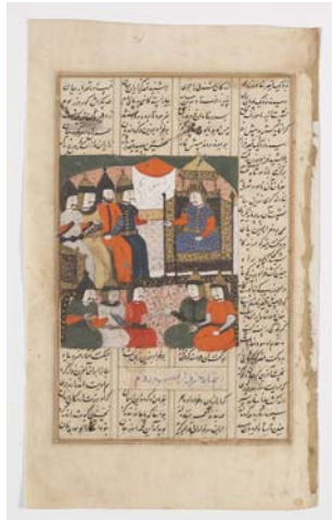
Shahnameh Exhibition: An enthroned ruler. Persian MS 15 McGill University Library

The Shahnameh is one of the foremost literary works to encapsulate the breadth and depth of Iran's historical trajectory. First composed by Ferdowsi to preserve Iran's cultural, linguistic and historical heritage, the Shahnameh, meaning 'the book of kings,' details the history of Iran prior to the Arab invasion in the 7th century. This literary work, a national epic composed in 52,000 couplets tells the story of heroes, villains, monsters and offers sage advice on moral lessons in governance. Legendary are the stories of its famous kings and heroes, especially of Rostam who so fearlessly defended the Persian kingdom in many spectacular battles against the hostile Turanians from the North. The epic also relates the important features of ideal kingship. It narrates the battle between Good and Evil, and is a constant reminder that life is just a transitory memento. 8