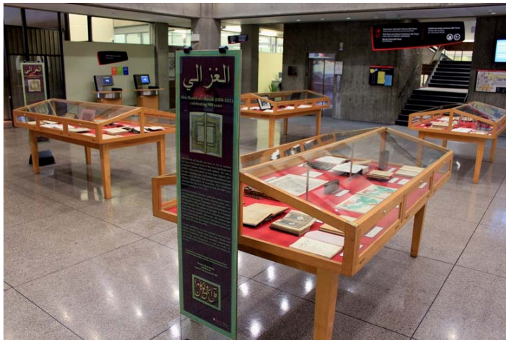
Exhibition celebrating al-Ghazali, Humanities and Social Sciences Library, McGill University.

Material from McGill Library collections is regularly displayed in exhibition cases of almost all branches. The largest of these display areas is in the entrance hall of the Humanities and Social Sciences Library. RBSC, located on the 4th floor of the same building, offers similar vitrines in the public area, as well as smaller cases inside the RBSC reading room.