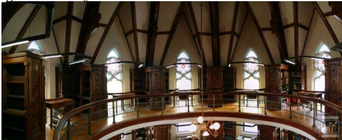
Octagon Room, Islamic Studies Library, Photo: K. Fiedler

In contrast with visiting the exhibition display in person, the digital images provide another view, one where the miniature painting is isolated on a neutral background, free from distraction and (where possible) to zoom in on specific elements. Moreover, the digital exhibition also allowed for extended examination outside of library hours thus, providing more opportunities to inspect and reflect on a particular image or images. This contrast provided the students with the opportunity to grapple with current debates surrounding the digitization of rare materials: what are the positive and negative aspects of being able to touch and sense a physical object versus its digital surrogate; what can one learn by contrasting these mediums? What is lost or gained with such intersections and opportunities? These are questions that researchers, faculty members and librarians contemplate when making materials available to a wide audience while also taking advantage of the opportunities of the digital realm.