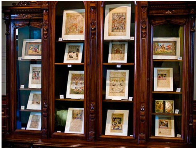
Shahnameh Exhibition, Islamic Studies Library, Photo: K. Fiedler

previously through the glass of the exhibition case, or online. Each presenter prepared a ten-minute discussion on different aspects of the epic poem and the leaves on display. The presentation discussed some of the major characteristics of Persian miniature painting, paint pigments, paper processes used to produce the leaves, and an introduction to a history of the Shahnameh, the pieces in McGill's collection and the provenance of some of the items. The presentations were expanded by students' questions and observations, which ranged from the proper care and housing of such rare, paper-based items, to the style and type of headgear worn by the characters depicted in the paintings. As well, several students shared their delight, as the leaves were turned from verso to recto, in discovering that the paintings were not stand-alone images, rather leaves long since separated from a manuscript, enveloped in the epic tale with text on the verso.