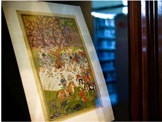
Shahnameh Exhibition: Gurgin betrays Bizhan. Persian MS 26 McGill University Library.

In contrast with visiting the exhibition display in person, the digital images provide another view, one where the miniature painting is isolated on a neutral background, free from distraction and (where possible) to zoom in on specific elements. Moreover, the digital exhibition also allowed for extended examination outside of library hours thus, providing more opportunities to inspect and reflect on a particular image or images. This contrast provided the students with the opportunity to grapple with current debates surrounding the digitization of rare materials: what are the positive and negative aspects of being able to touch and sense a physical object versus its digital surrogate; what can one learn by contrasting these mediums? What is lost or gained with such intersections and opportunities? These are questions that researchers, faculty members and librarians contemplate when making materials available to a wide audience while also taking advantage of the opportunities of the digital realm.