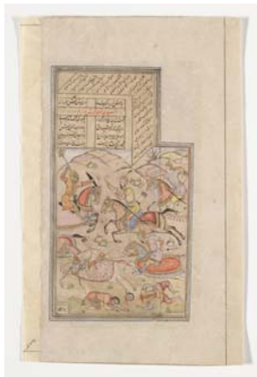
Shahnameh Exhibition: Iskandar kills the Abyssinian monster. Persian MS 51