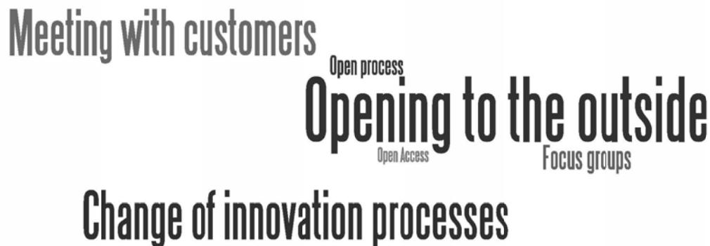
Figure 3: Word Cloud: Associations with the term Open Innovation

The result confirms the impression that this term is only little-known. By citing the definition for Chesbrough and giving further remarks and examples, the term open innovation was explained.