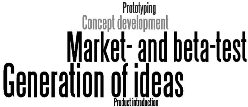
Figure 4: Word Cloud: customer integration in the various stages of the innovation process

In the context of this question the different phases of an innovation process were reproduced. The answer with the most frequent mentioning that the customer could be integrated in the idea generation doesn't astonish. The high number of the answers, however to the phase of the market or beta tests surprises. Development of concepts as well as prototyping has a certain meaning among the persons interviewed. This allows at last the conclusion that one ascribes a high degree of competence to the customer and takes him seriously very much.