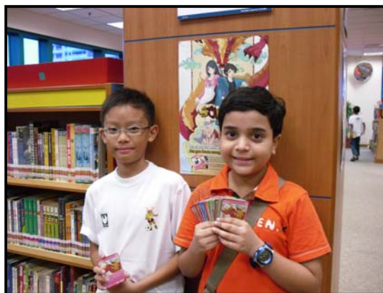
Boys at Woodlands Regional Library showing off their collection of Quest cards with the Quest poster in the background

The mechanics of Quest is simple—borrow books and collect cards. With all 60 cards lined back to back, children would be able to read part of the story. 2 In addition, the cards can be played like any ordinary trading card set as each card has points and power values which gives children the incentive to collect multiple cards. The Quest format is instantly recognisable to children and no additional effort or publicity is required to get their support and understanding of what to do. What worked out in NLB's favour was that children took it upon themselves to encourage their friends to take part in the programme to facilitate their opportunities for card trading. Peer to peer recommendation, in this case, was more effective than any poster or publicity campaign.