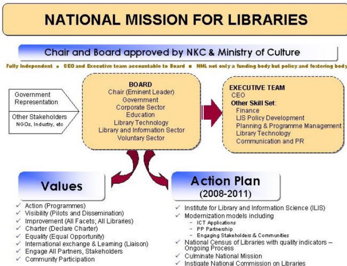
Figure 2: Values and Action Plans of Proposed National Mission on Libraries